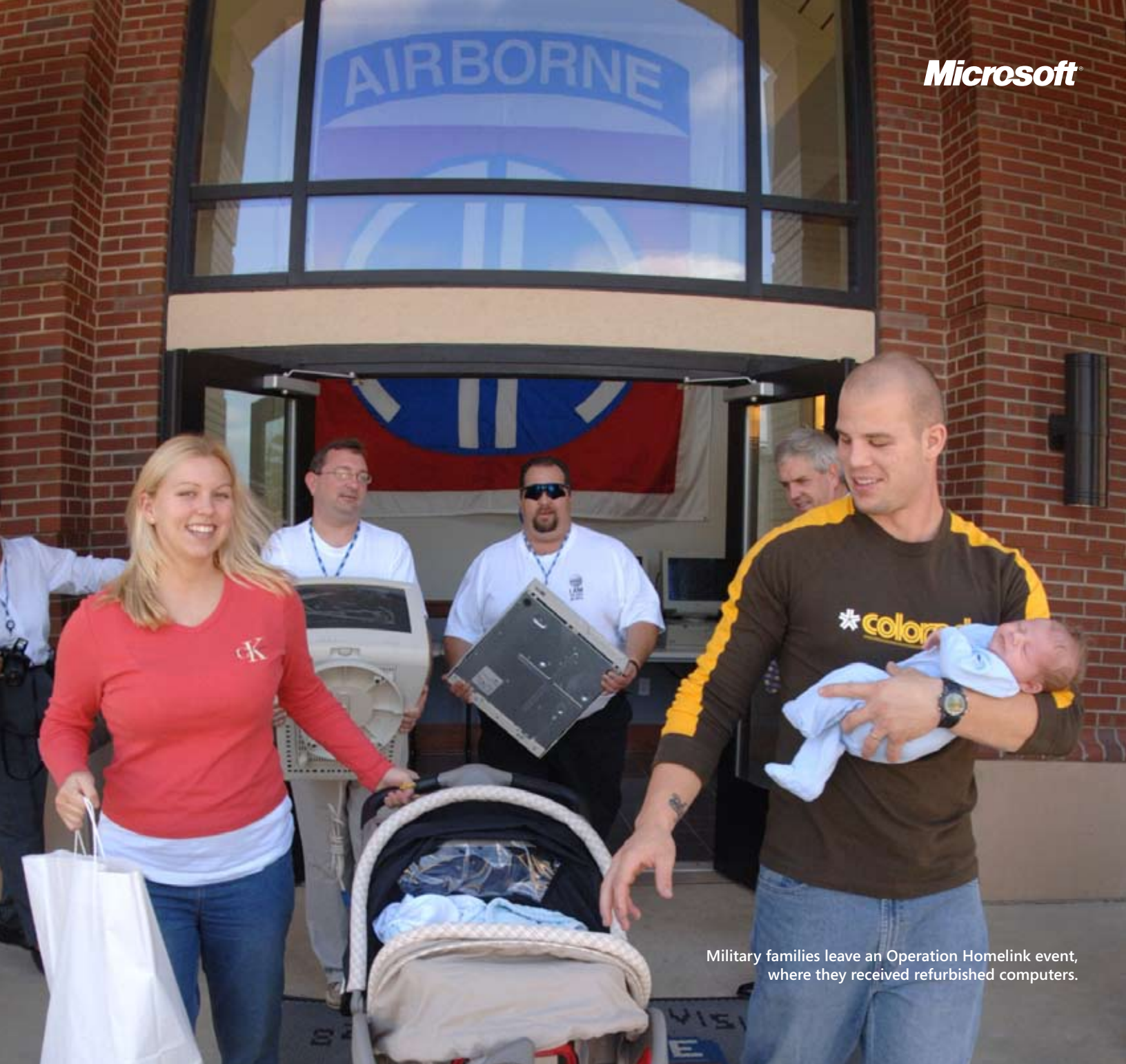
Military families leave an Operation Homelink event, where they received refurbished computers.