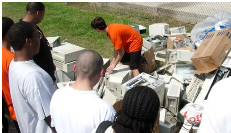
As a part of CACRC’s Computer for Louisiana’s Kids program, students sort their electronic waste at the end of the school year. CACRC distributes refurbished computers to schools in need around the state.

In addition to its Hurricane Relief Project, CACRC operates Computers for Louisiana’s Kids, a program that encourages state agencies to donate unneeded PCs, which are then refurbished and made available to hard-pressed Louisiana public schools. In 2007 alone, the program distributed more than 800 computers and nearly 500 monitors. Another CACRC program, Computers for Louisiana’s Families,