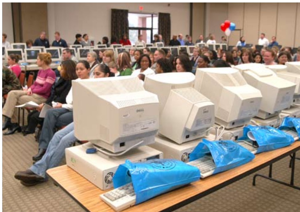
Operation Homelink presented more than 100 families of Fort Campbell soldiers with refurbished Dell computers. The computers help the families to keep in touch with their loved ones serving overseas.